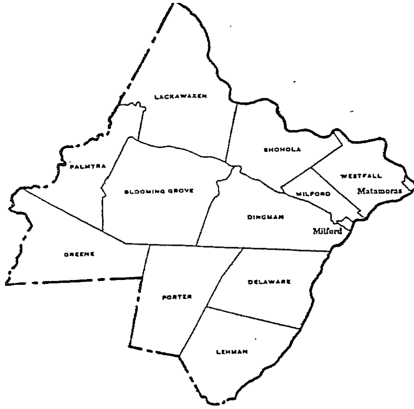
Area of Pike County 547.2 square miles

The County lies in the northeastern part of the state along the Delaware River, it borders partly on New York State and New Jersey. Lake Wallenpaupack, along the county's northwestern border, forms its boundary with Wayne County. The southwestern side lies in the heart of the famed Pocono Mountains. In area, Pike County covers 547.2 square miles including about 13 square miles of water. The County is approximately one-half the size of the entire state of Rhode Island.